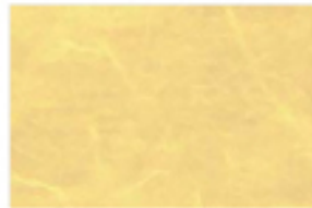
Double & DeepXX 24kt ◆ MA24.00DB AW=18g 100% Gold