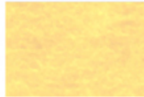
Florin MA23.00FG AW=16g 95.2% Gold