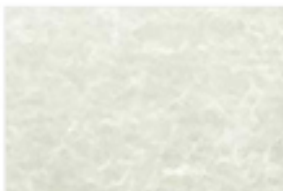
White 6kt MA6.00WH AW=16g 25% Gold