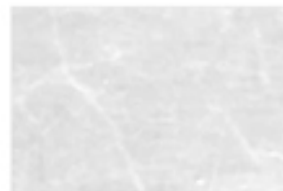
Silver MA00.00SH AW=33g MA140SV AW=65g 100% Silver