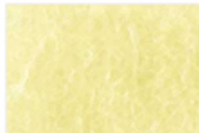
Pale 16kt ◆■ MA16.00PL AW=16g 65% Gold