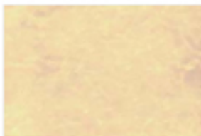
Moon Gold 22kt ◆■ MA22.00MG AW=16g 92.0% Gold