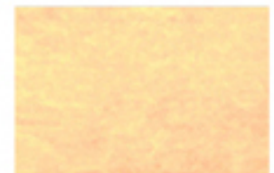
Caplain 20kt MA20.00CP AW=16g 80% Gold