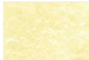
White 13 1/4kt ◆ MA13.25WH AW=16g 55% Gold