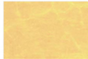
Rosenoble 23 3/4kt ◆ MA23.75RN AW=18g 98.4% Gold