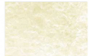
White 12kt ◆■ MA12.00WH AW=16g 51% Gold