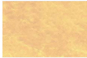
Red Gold 23kt ◆ MA23.00RG AW=16g 97.5% Gold