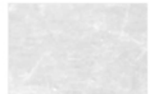
Silver Thin MA00.00ST AW=20g 95mm x 95mm 100% Silver

Loose leaf oil gilded on white paper. The ◆ indicates leaf that is also available in patent form.