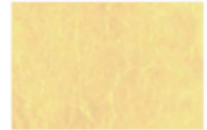
23kt ◆■ MA23.00DB AW=18g MA23.00GL AW=16g MA23.00SF AW=16g 95.2% Gold