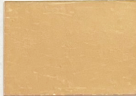
Champagne/Rose Gold ◆★ MA22.50CH AW = 16g 94% Gold-6% Palladium