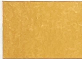
Rosenoble 23 1/2kt ◆★ MA23.75RN AW = 18g MA23.75RN/21 = 21g 98.4% Gold-6%Silver-1% Copper