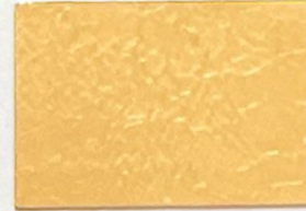
Red Gold 23kt ◆ MA23.00RG AW = 16g 97.5% Gold-2.5% Copper