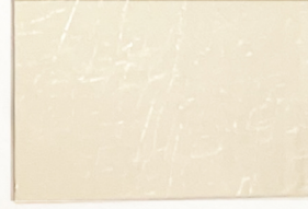
100% Silver ◆■ MA00.00SH 85mm AW=40g MA00.00SV 95mm AW=28g MA00.00ST 95mm AW=20g MA140SV 140mm AW=65g