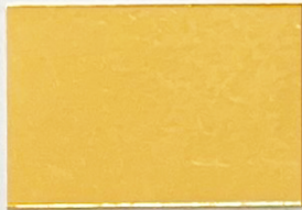
22kt ◆■ MA22.00DB AW = 18g MA22.00GL AW = 16g MA22.00SF AW = 16g 91.8% Gold-5.9% Silver-2.3% Copper