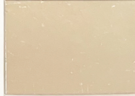
Platinum ◆★ MA00.PT/80 AW = 22g 100% Platinum