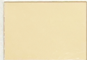
White 12kt ◆■ MA12.00WH AW = 16g 51% Gold-49% Silver

Loose leaf oil gilded on white paper. AW = average total weight (gold + alloy) in grams per 1000 leaves