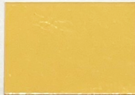
French Pale 22kt MA22.00FP AW = 16g 91.5%Gold-8.5% Silver