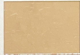
Captain 20kt ◆■ MA20.00CP AW = 16g 80% Gold-4% Silver- 12% Palladium-4%Platinum