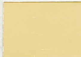
Pale 16kt ◆■ MA16.00PL AW = 16g 65% Gold -35% Silver