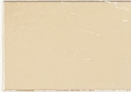
Palladium Glass ◆■★ MA00.PG/80 AW = 16g 100% Palladium