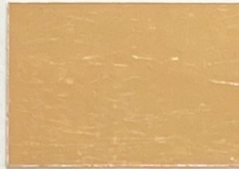
Moon Gold ◆■ MA22.00MG AW = 16g 92% Gold-3.5%Silver- 4.5%Palladium