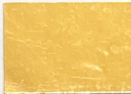
Dukaten 23 1/2kt ◆■★ MA23.50DD AW = 18g 98% Gold-1.2% Silver- .8% Copper