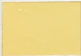
Lemon 18kt ◆ MA18.00LE AW = 16g 75% Gold-25%Silver