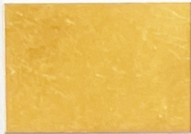
Deep Double 24kt ◆★ MA24.00DB AW = 18g 100% Gold