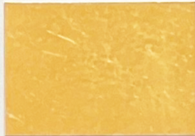
Florin 23kt MA23.00FG AW = 16g 95.2% Gold-2.4% Silver- 2.4% Copper