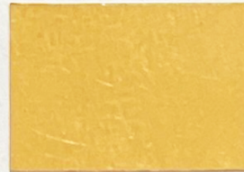
23kt ◆■★ MA23.00DB 18g MA23.00GL 16g MA23.00SF 16g 95.2% Gold-3.6% Silver- 1.2% Copper