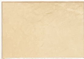
White 6kt ◆ MA6.00WH AW = 16g 25% Gold-75% Silver