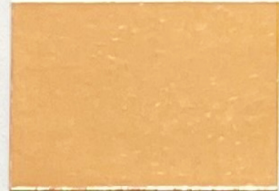
Rose Gold 22kt ◆■ MA22.RG/80 AW = 14g 92% Gold - Copper